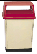
56 Gallon Cans