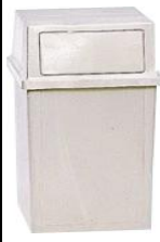
40-50 Gallon Cans