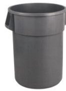
60 Gallon Cans