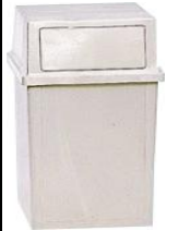
40-50 Gallon Cans