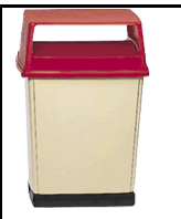
56 Gallon Cans