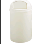
20-30 Gallon Cans