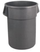
60 Gallon Cans