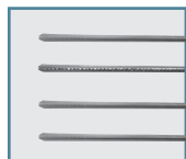
(4) Cutting Blades (1 installed)