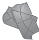
(2) Roll Width Adaptors