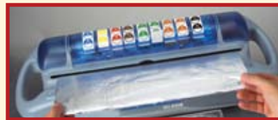
SafetyWrap® Station dispenses foil as well as film.